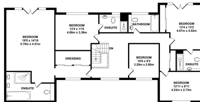
FIRST FLOOR APPROX. FLOOR AREA 1642 SQ.FT. (152.59 SQ.M.)